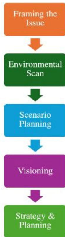
Figure 1: A Typical Strategic Foresight Process Flow

Note: Based on insights from Bengston (2013).